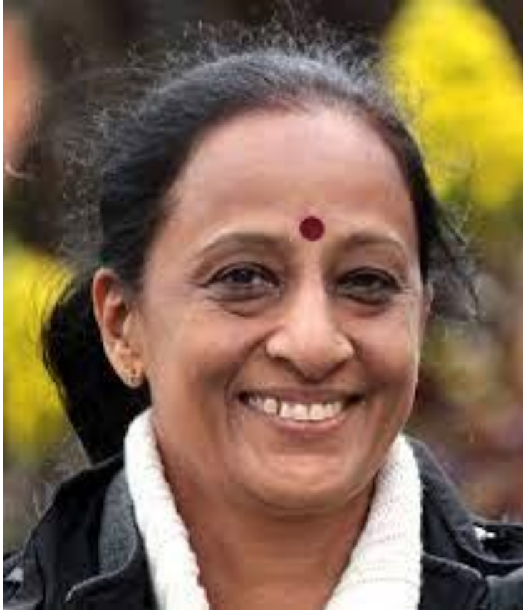
Honorary Chair Person ISOLA Kerala Chapter