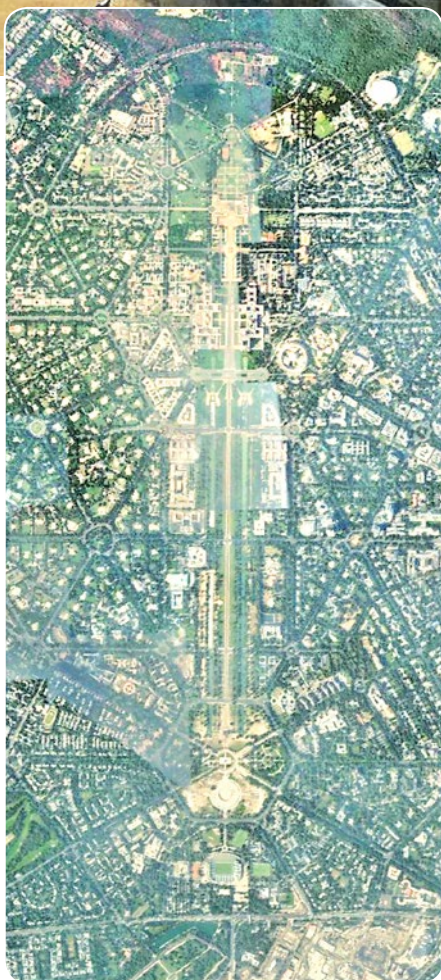
SATELLITE VIEW OF THE EXISTING CENTRAL VISTA, NEW DELHI

This project is a precedent for all important public projects that are being planned and must be seen as such. Without a proper public consultative process and also without well-considered site related and other studies that should precede any project of such dimensions, we are setting the tone for the years to come.