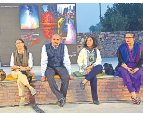
| THE ORGANISING TEAM OF ISOLA DELHI-NCR CHAPTER AT THE SUNDAR NURSERY

► Landscape lighting offers an incredible opportunity to enjoy a space at night. It not just makes outdoor space usable at night , it also adds a magical experiential view of the surroundings. Lightscape 102 was a workshop that aimed to provide landscape architects with an introductory knowledge and tools that they need to develop outdoor lighting installations and answer some of the many questions that one often encounters while designing an outdoor lighting system.