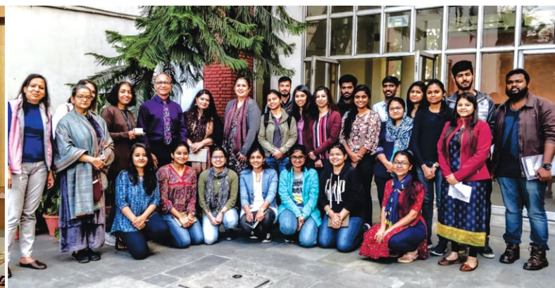
PANELISTS AT THE DUAC SECOND ROUNDTABLE