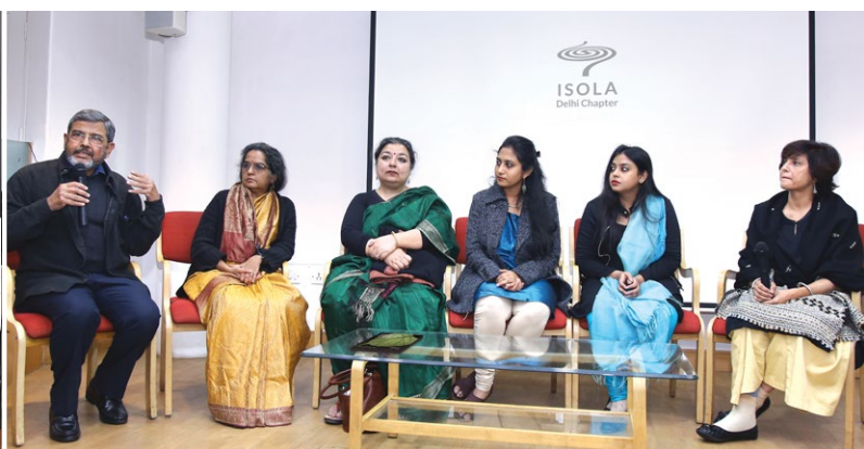
| PANEL DISCUSSION ON CULTURAL LANDSCAPES