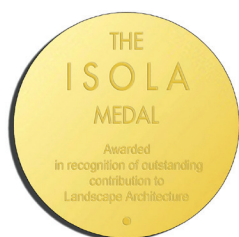
THE ISOLA MEDAL