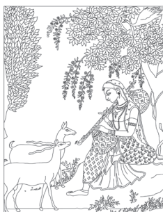
THE LANDMARK AWARD