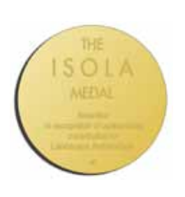
THE ISOLA MEDAL