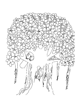
ISOLA STUDENTS' AWARD