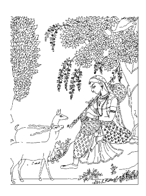
THE LANDMARK AWARD