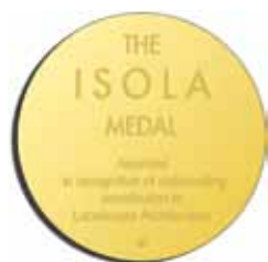
THE ISOLA MEDAL