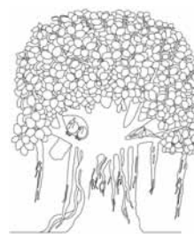
ISOLA STUDENTS' AWARD