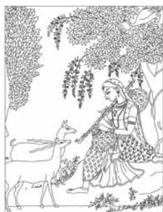
THE LANDMARK AWARD