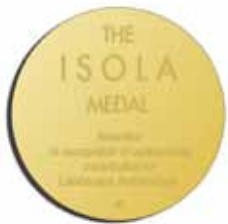
THE ISOLA MEDAL