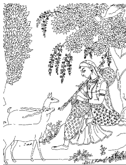
THE LANDMARK AWARD